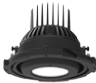
DRD3M Adjustable LED Module