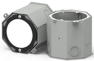
DRDHNJC Deep Junction Box Concrete New Construction Frame-in Kit