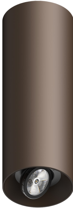
Large, bronze, surface mount shown